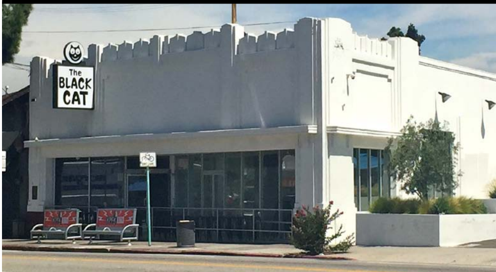
In 2008, the Black Cat in Silver Lake was designated as a Los Angeles Historic-Cultural Monument for its early and significant role in the LGBTQ civil rights movement. A police raid on December 31, 1966 led to a peaceful protest in February 1967. This demonstration of 300-600 individuals was one of the earliest such documented events in LGBTQ history, predating New York's famed Stonewall rebellion by two and a half years.