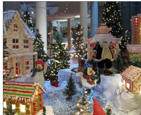
Gingerbread houses displayed at the Late Modern Westin Bonaventure Hotel in downtown L.A.

All tours are $5 for Los Angeles Conservancy members and youth 17 and under; $10 for the general public; reservations are required. Space is limited, so reserve now! Visit laconservancy.org/tours or call (213) 623-2489.