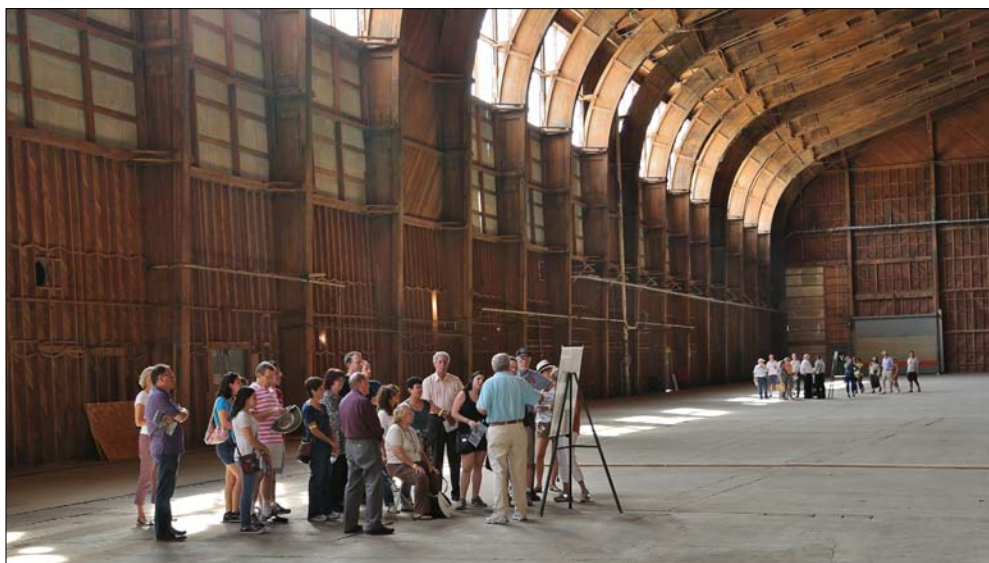
Tour attendees were impressed by the enormous Cargo Building, one of the largest wooden buildings ever built. It was designed to house the construction of the H-4 Hercules plane, also known as the Spruce Goose.

Saturday, October 24: The day dawned bright and beautiful over the former Hughes Aircraft Company campus, a welcome change from the torrential rain and winds that greeted staff and guests the first time the Conservancy toured this historic site in 2011.