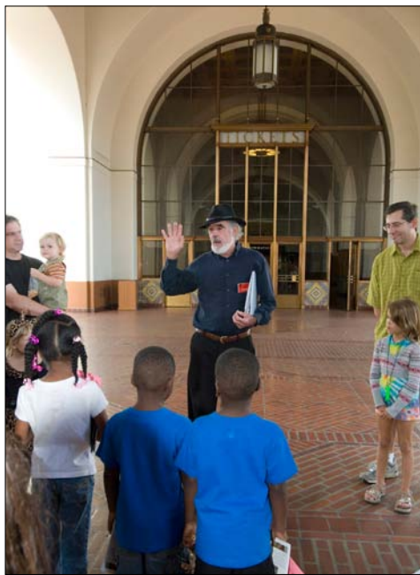
Bring the whole family to our special child-friendly tours of Union Station!

The Union Station for Families tour will take place on three Sundays: November 29, December 6, and December 13. It starts at 11 a.m. and lasts about an hour. Please note that the tour does not include boarding a train—but you and your family will have a ball!