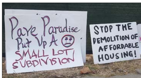
Local residents have mobilized to save a 1923 bungalow court at 750-756 ½ North Edinborough Avenue.

The Meyer Courtyard Apartments and the Edinborough Bungalow Court exemplify the growing threat to historic multi-family residences in Los Angeles—and the resulting loss of community character. This and other types of development pressure further underscore the need for neighborhood conservation tools used in other cities, such as conservation districts.