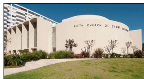
Former Fifth Church of Christ, Scientist in Hollywood.

As reported in these pages a year ago, a mixed-use development project in Hollywood