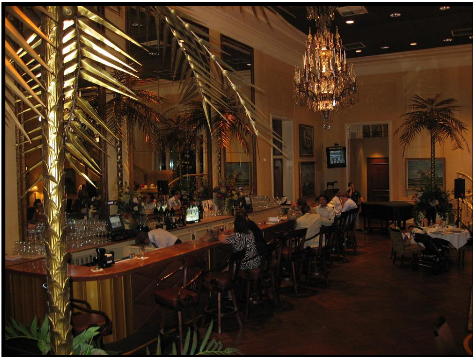
Bar at Chandelier Room, 2008.