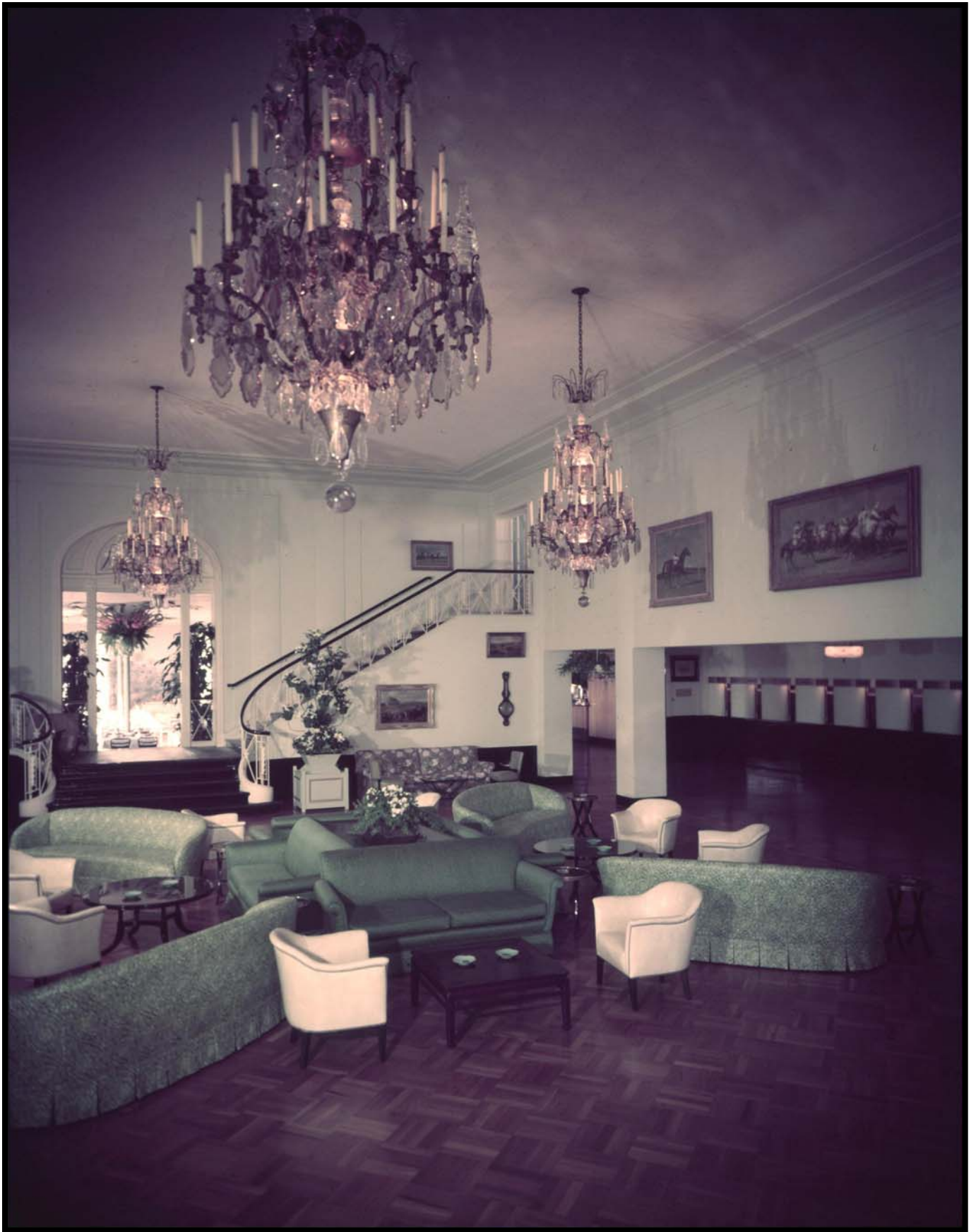
Chandelier Room, circa 1956.